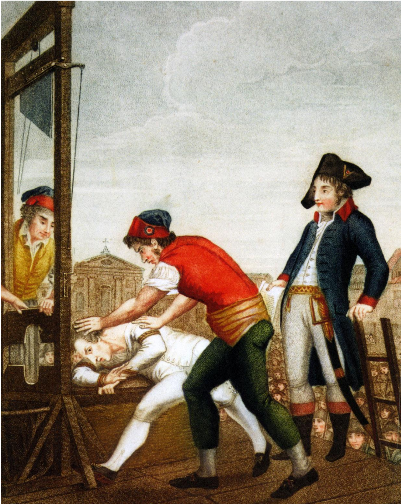
The guillotine became the symbol of French Revolution and its Reign of Terror. Maximillien Robespierre, the architect of the Terror, became one of its victims .